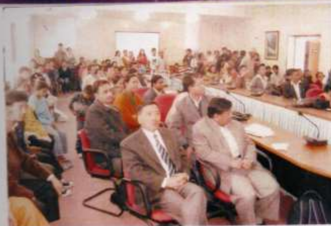
Fig. vi - Registration camp for cleft lip & cleft Palate on 7 th March 2009 at STNM Hospital Complex.