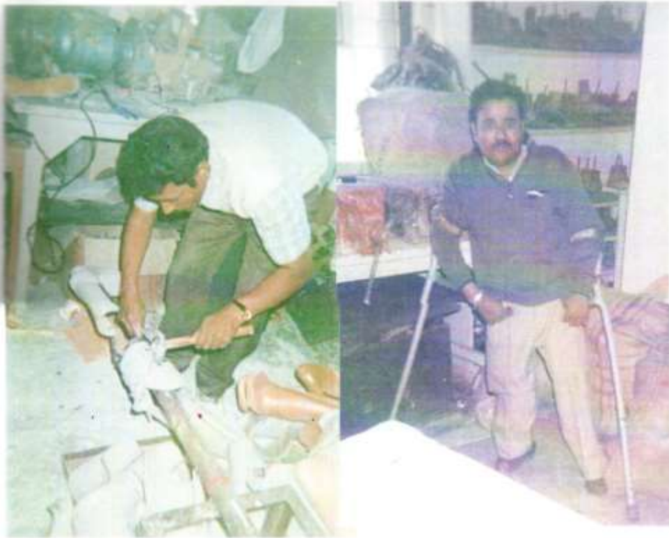
Fig. xv. Left- Making of Caliper (Knee Ankle Foot Orthosis) at SVSS workshop. Right - patient walking with the help of calipers.

Samiti is in need of new & latest technology equipments to improve the process of artificial limbs & calipers to facilitate the needy persons.