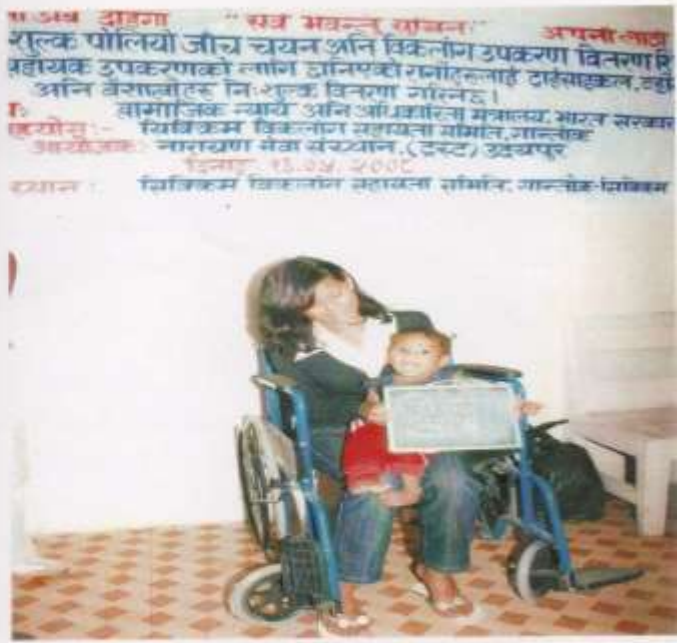
Fig. iv. Polio affected persons(13/05/'08 Identification Camp at SVSS Workshop Zero point, Gangtok in collaboration with Narayan Sewa Samiti, Udaipur)