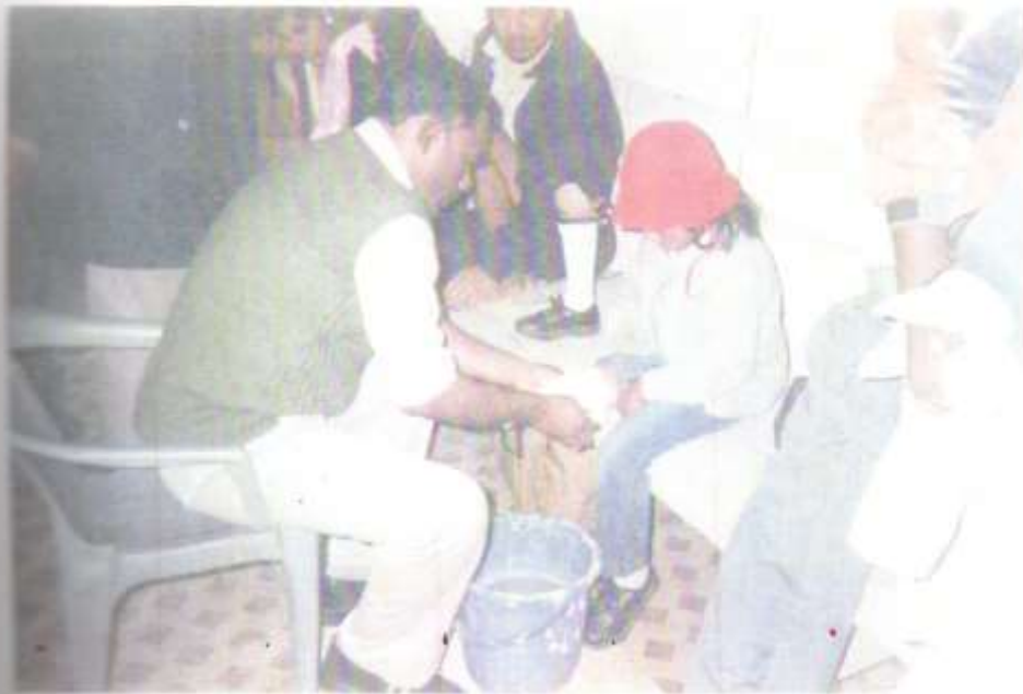
Fig. xiii – Making of Artificial Limb(Jaipur Foot) at SVSS Workshop.