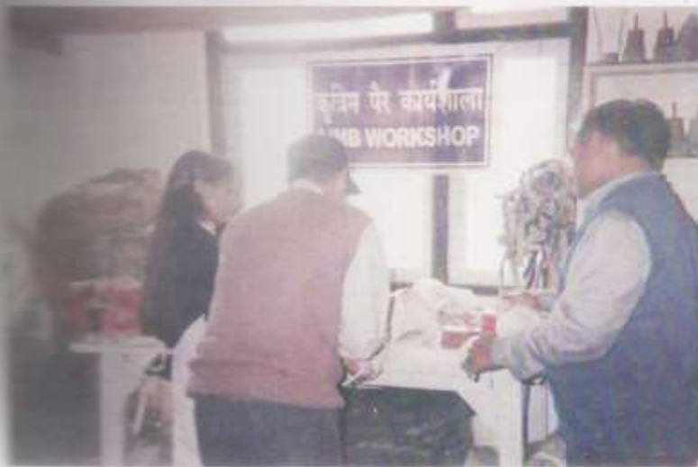
Fig. xii – SVSS Workshop at Zero Point, Gangtok.

Shriam Viklang Sahayata Samiti is running this workshop regularly. The trained technicians prepare each artificial limbs & calipers in a single day and fitment to needy persons provided at free of cost. The correction to artificial limbs & calipers is also done in this workshop. Bhagwan Mahaveer Viklang Sahayata Samiti, Jaipur had provided us the materials required for Artificial limbs & calipers in the year 2008 which is available in this workshop.