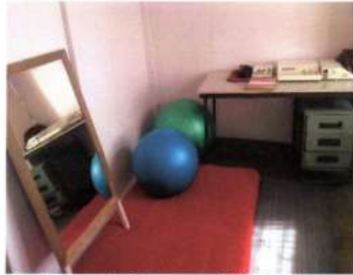
Physiotherapist Equipments (Sponsored By His Excellency, the Governor of Sikkim)