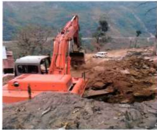
Site Leveling of Composite Rehabilitation Centre at Reship, Tokal Bermiok