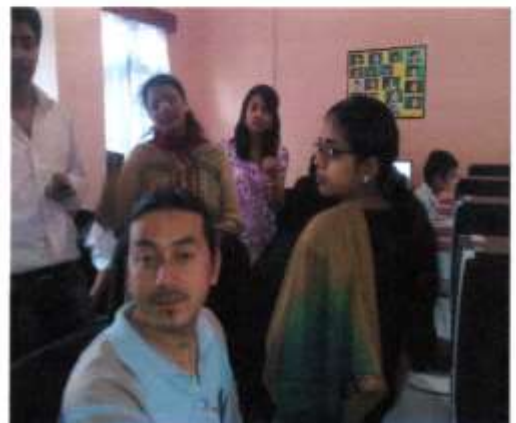
The function was attended by the Secretary Social Justice Empowerment & Welfare Department function.