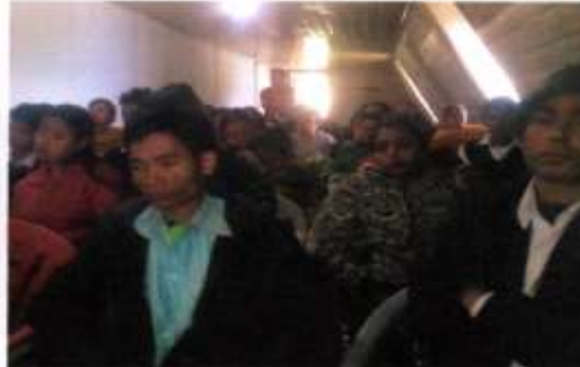
RELIGIOUS GURUS OF ENCHEY MONASTERY