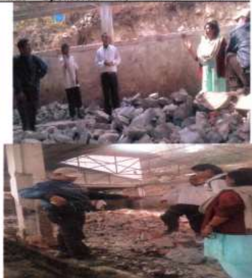
BEFORE RENOVATION OF THE COMPOSITE REHABILITATION CENTER