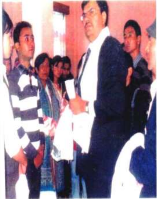
Celebration of World Disabled Day at SVSS Office Zero Point, Gangtok.