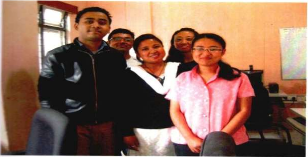
Teacher and Students of SVSS

01 st OCT 2012:- 2 nd Batch Computer Training and Beautician training courses started with 30 numbers of computer students and 15 numbers of beauty parlour students. The said training was sponsored by National Handicapped Finance & Development Corporation, Ministry of Social Justice & Empowerment Government of India through SABCCO Government of Sikkim.