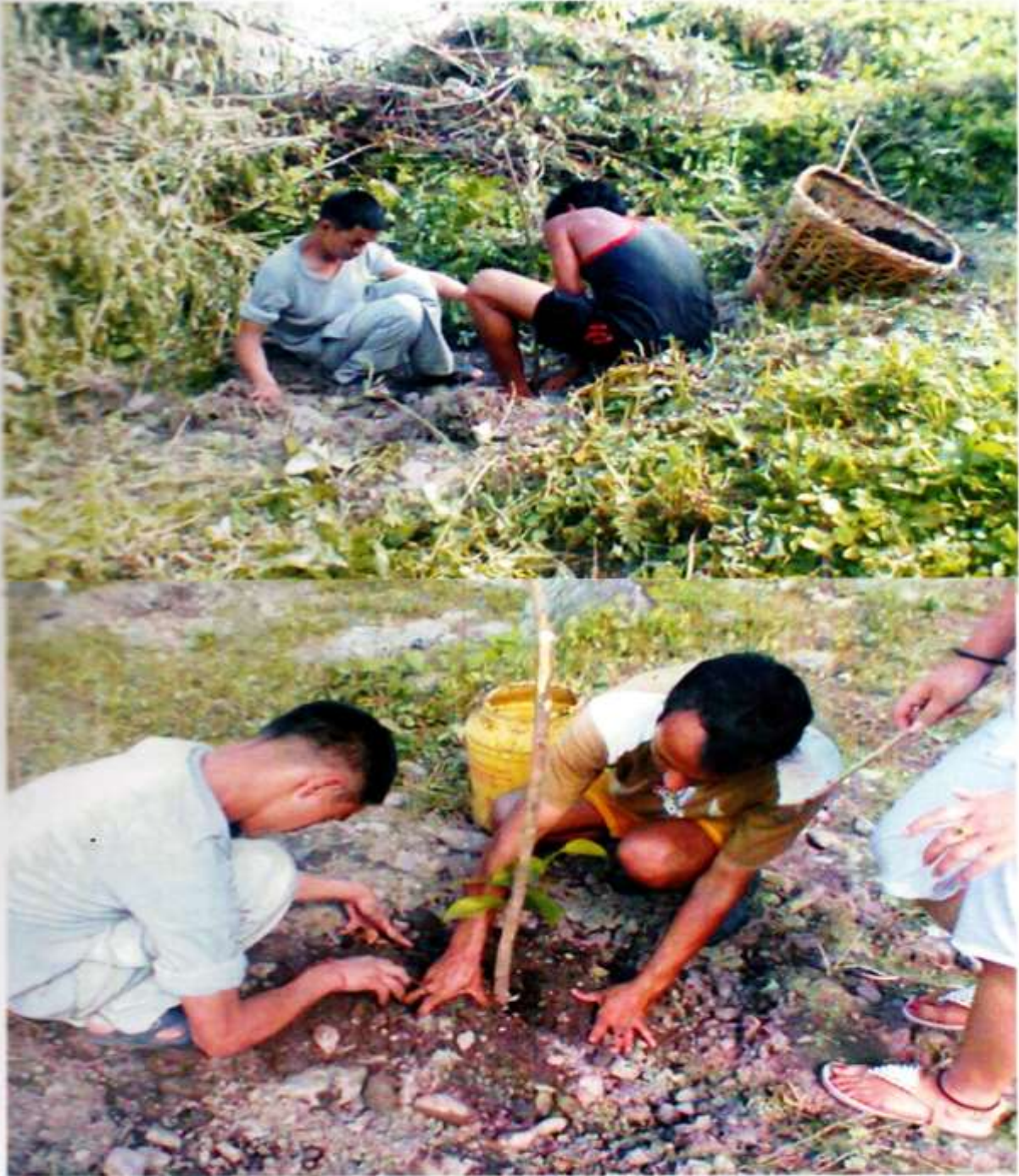
The Participants of 7 th PHASE STATE GREEN MISSION PROGRAMME 2012 were Disabled Students of SVSS.