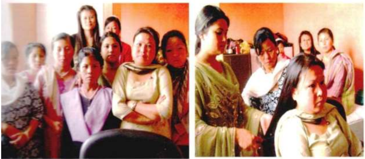
Instructor with Beauty Parlour Students