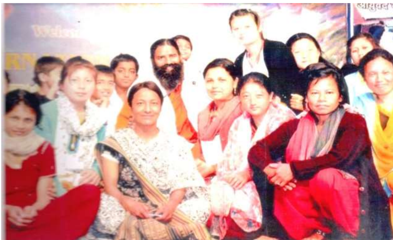
Our Trainees with Guru Ramdev at Patanjali Yogpeeth, Haridwar.