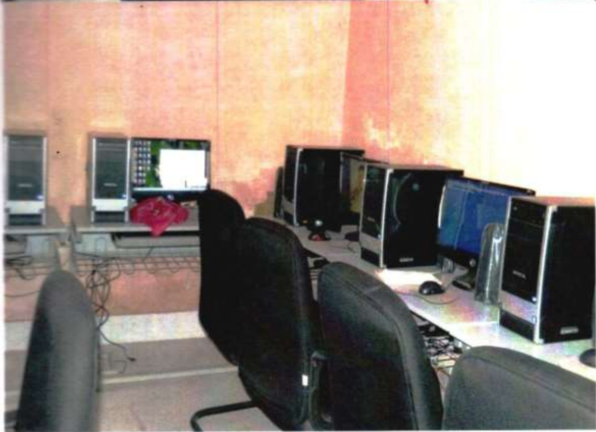
Computer Teachers & Students at SVSS Office, Gangtok.