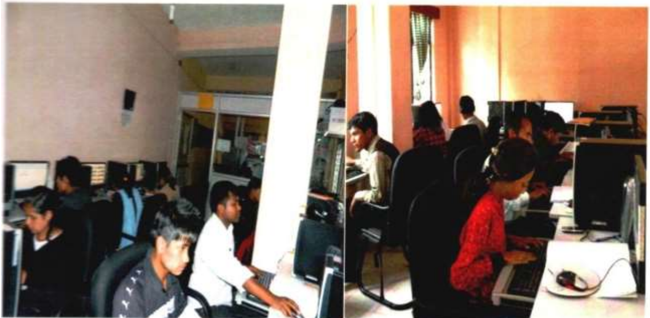
Students in progress