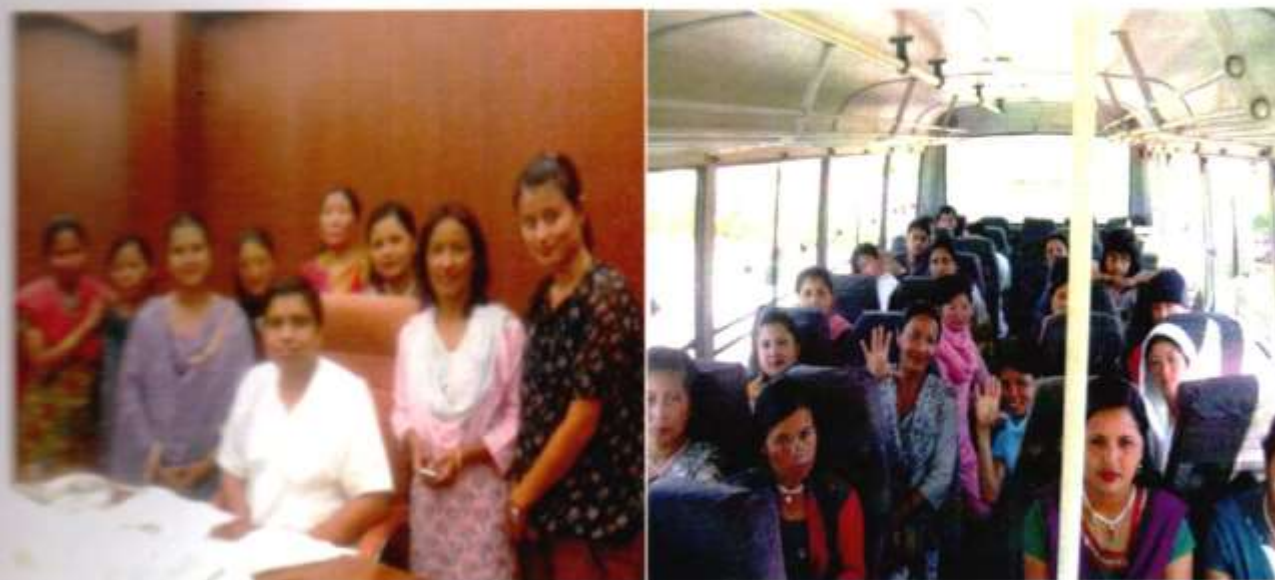
Our Trainees with Guru Balkrishna at Patanjali Yogpeeth, Haridwar.