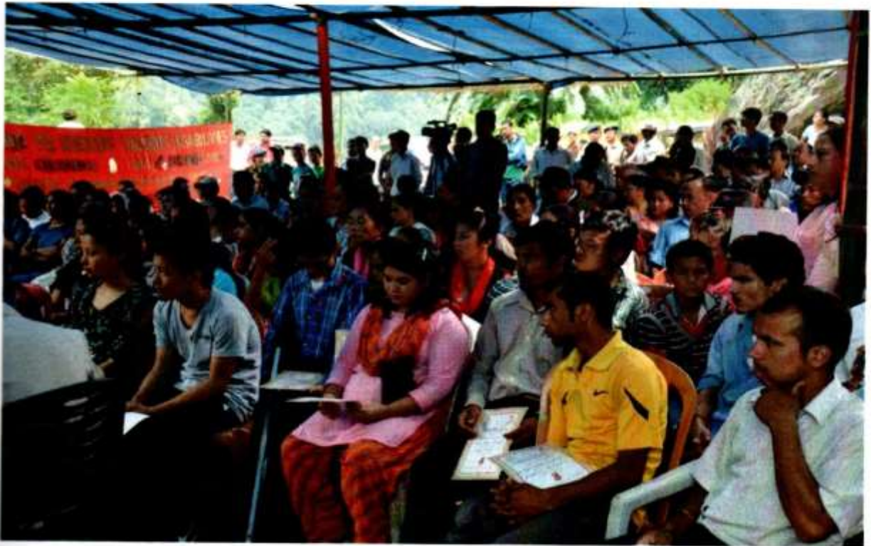
Viewers present in the felicitation program at Reshap Tokel Bermiok ,South Sikkim.