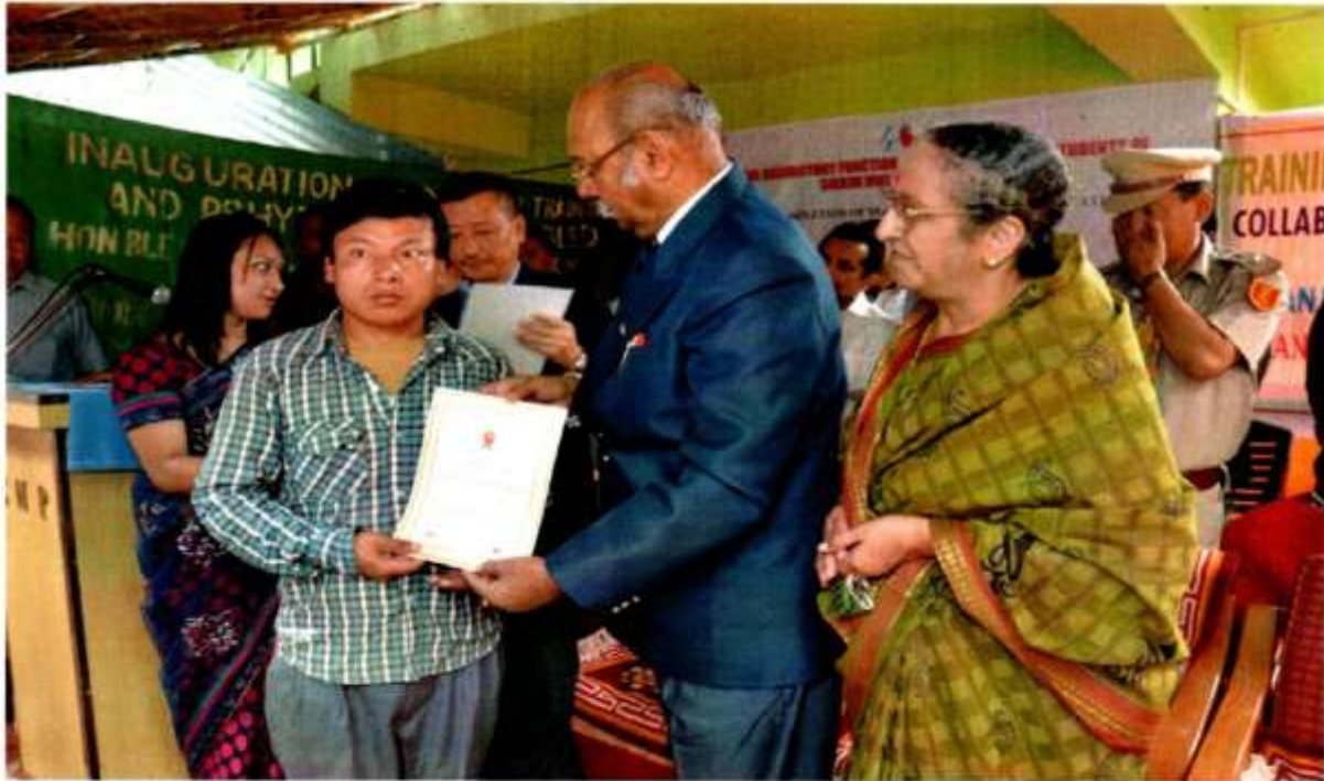
Distribution of certificate to computer students by Hon'ble Governor of Sikkim Shri Shrinivas Patil.