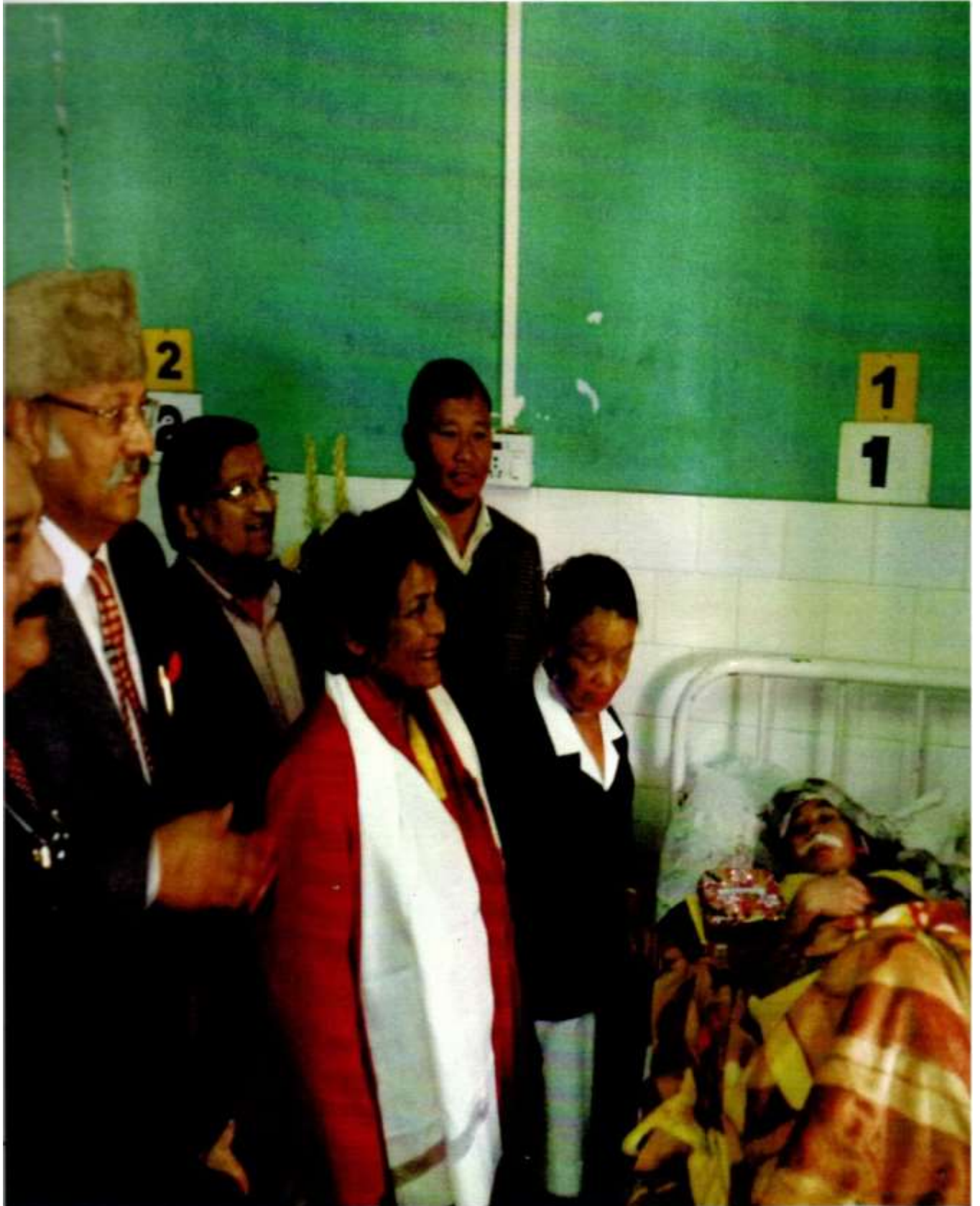
Hon'ble Governor Shri Shrinivas Patil visited different ward, to meet with the patient.