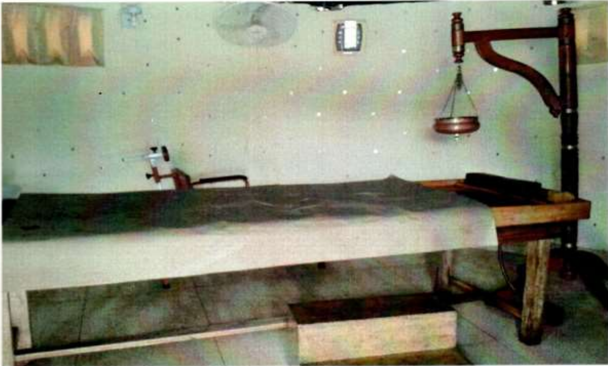
Pancha Karma Ayurveda & Yoga centre at Haridwar.