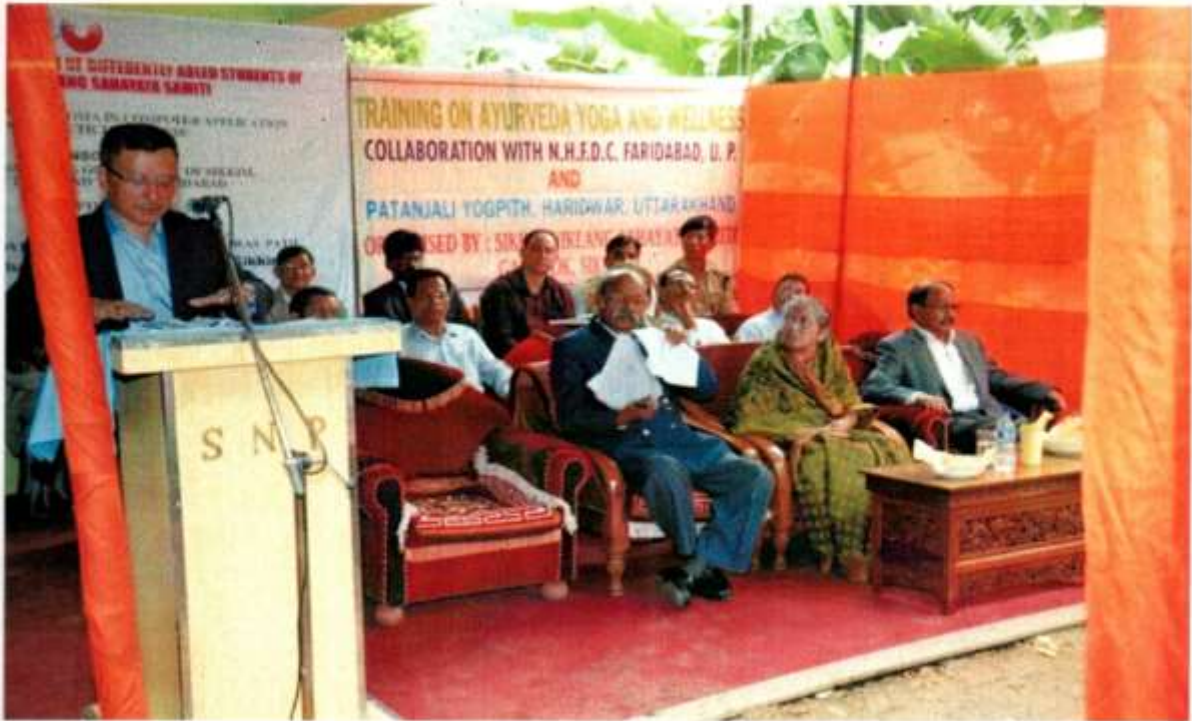
Speech of Hon'ble Speaker Shri K.T.Gyaltsen