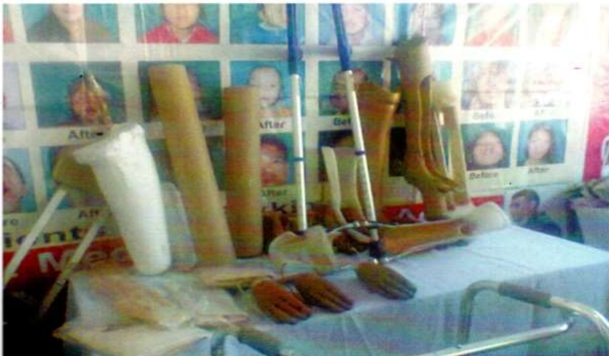
Display the Artificial Limbs of the workshop of SVSS Zero Point Gangtok.