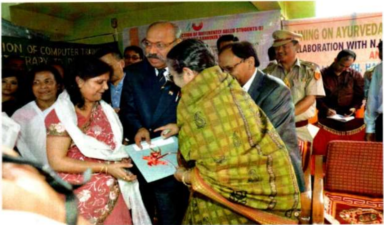
SVSS felicitated the Rotary Club South by Hon'ble Governor of Sikkim Shri Shrinivas Patil .