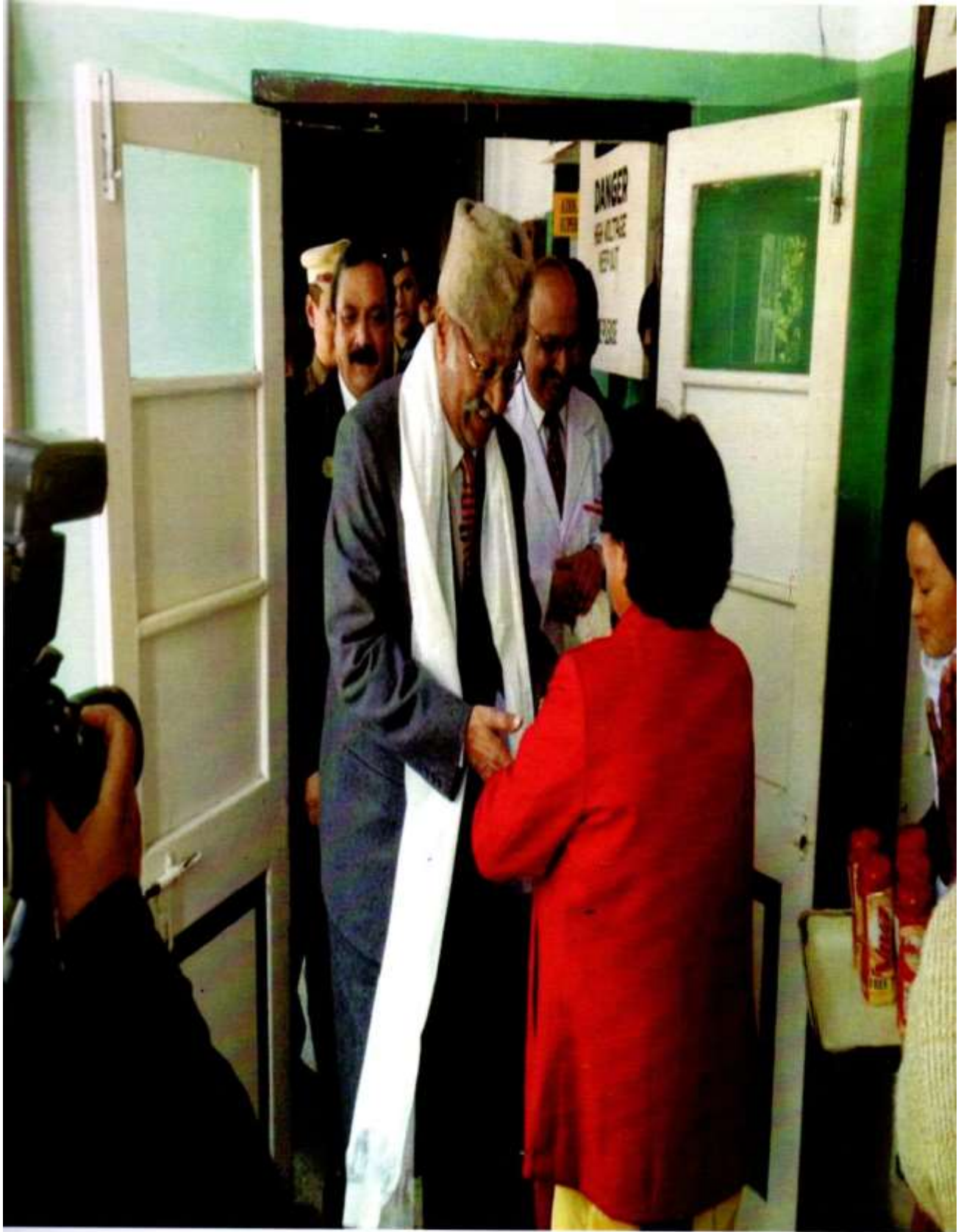
Hon'ble Governor Shri Shrinivas Patil visited during the surgery of the patients with Cleft lip, plate at S.T.N.M Hospital Gangtok.