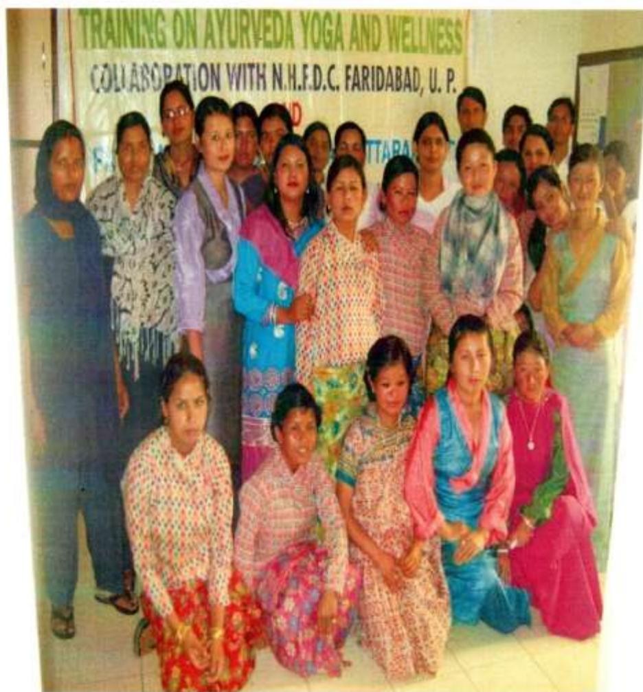
Beautician students with teacher of Pancha Karma Ayureveda & Yoga.

On 4 th May 2013- Thirteen physically challenged girls' students & three Escort return form Patanjali Hardwar after completing the two months Pancha Karma Ayureveda & Yoga course.