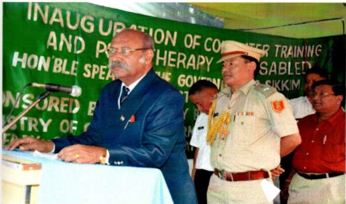
Speech of Hon'ble Governor of Sikkim Shri Shrinivas Patil.