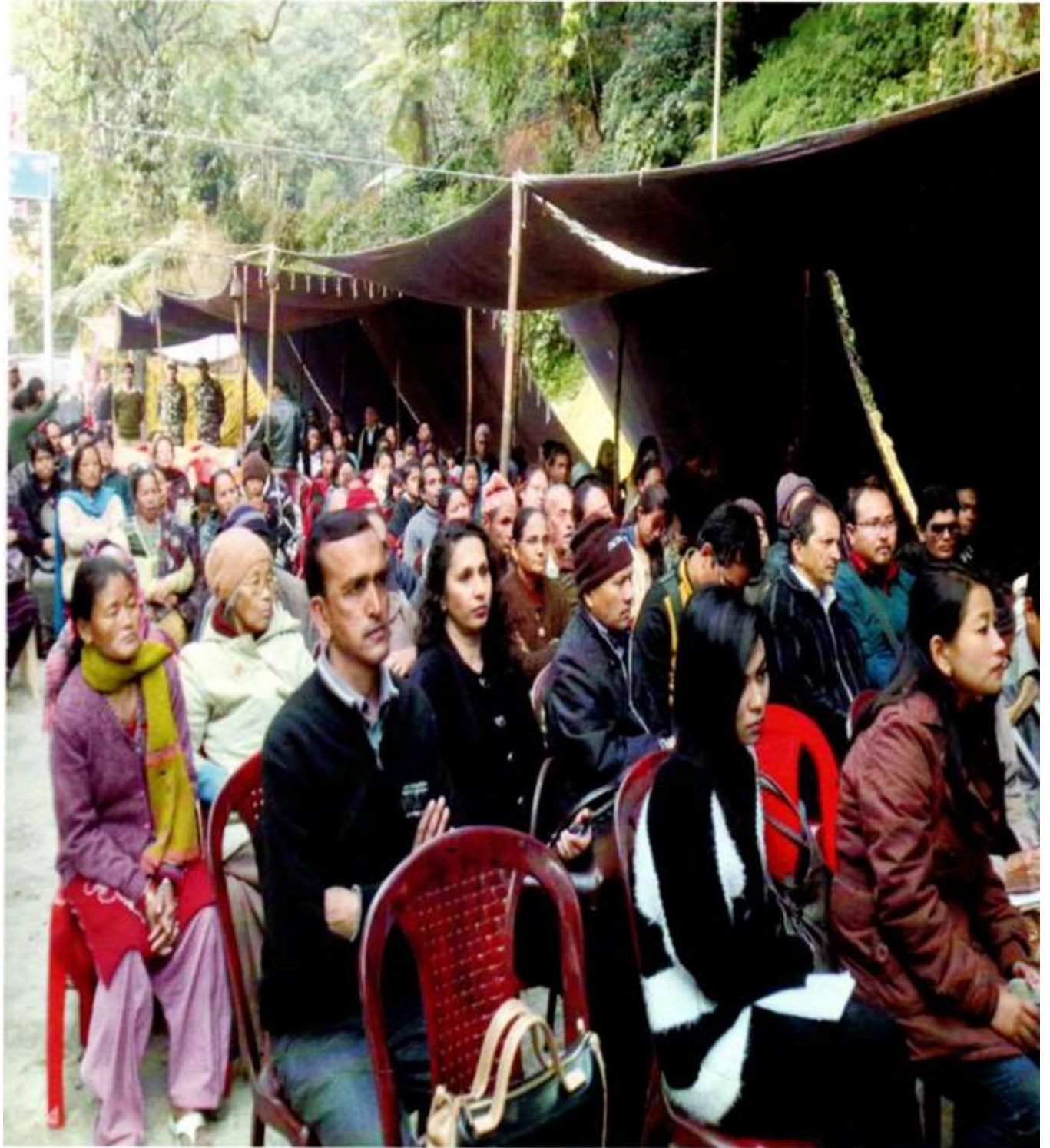
At the time of closing ceremony all the disabled people with their parents and guests were presents.