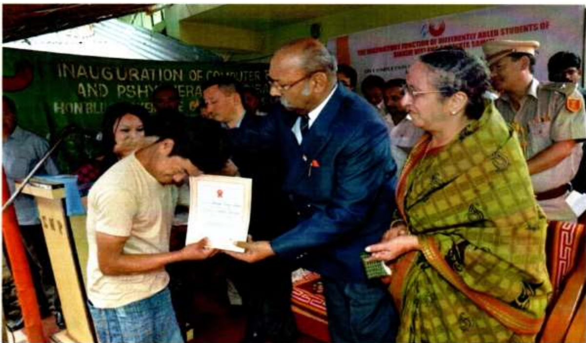
Distribution of certificate to computer students by Hon'ble Governor of Sikkim Shri Shrinivas Patil.