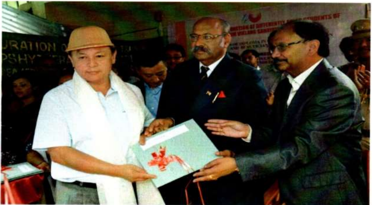
SVSS felicitated by Hon'ble HRDD Minister Shri N.K.Pradhan.