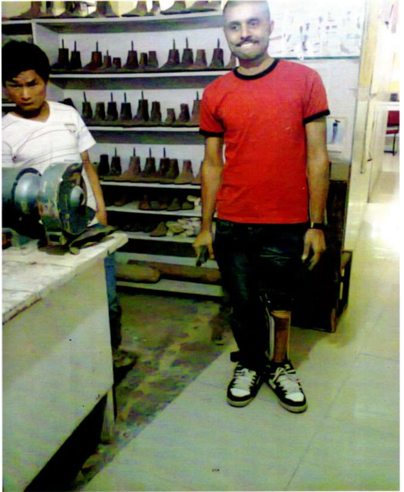
After fitting of Artificial Limbs