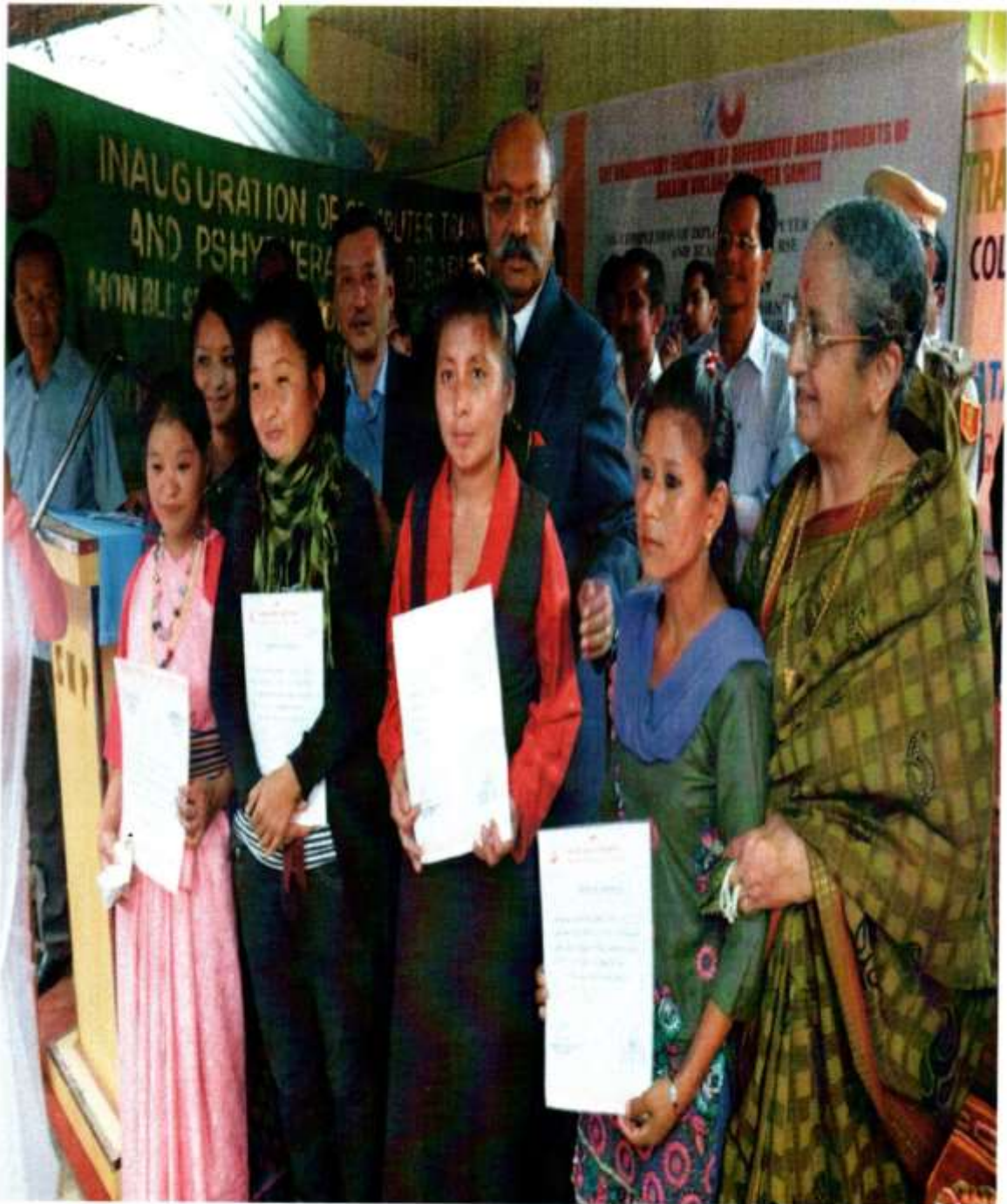
Distributed of certificate to beautician students by Hon'ble Governor of Sikkim Shri Shrinivas Patil.