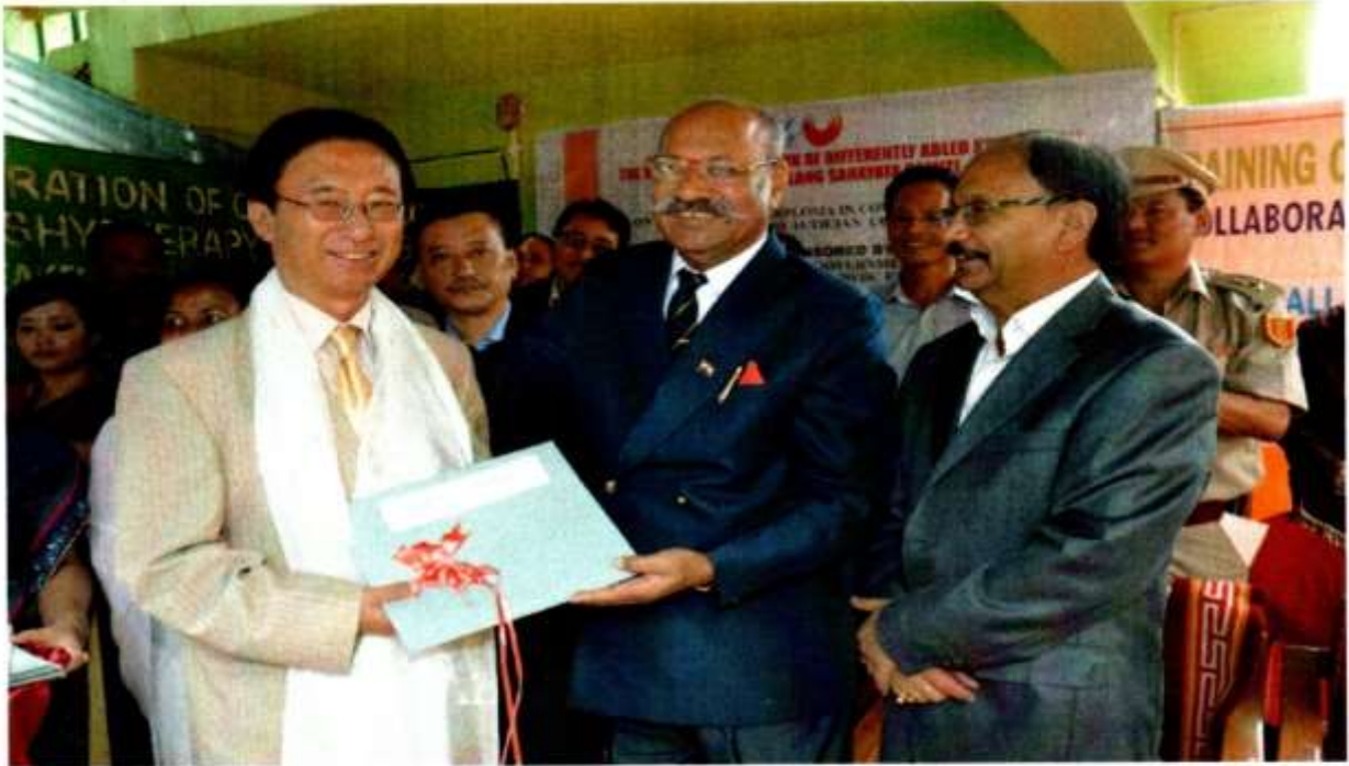
SVSS felicitated the DESMI Department by Hon'ble Governor of Sikkim Shri Shrinivas Patil.