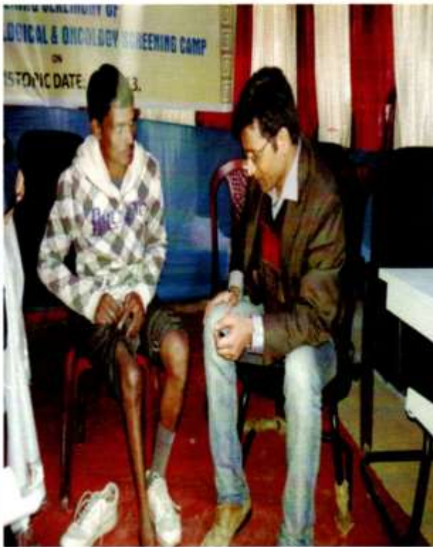
Doctors of North Bengal examine the patients of Jamshedpur, Jharkhand.