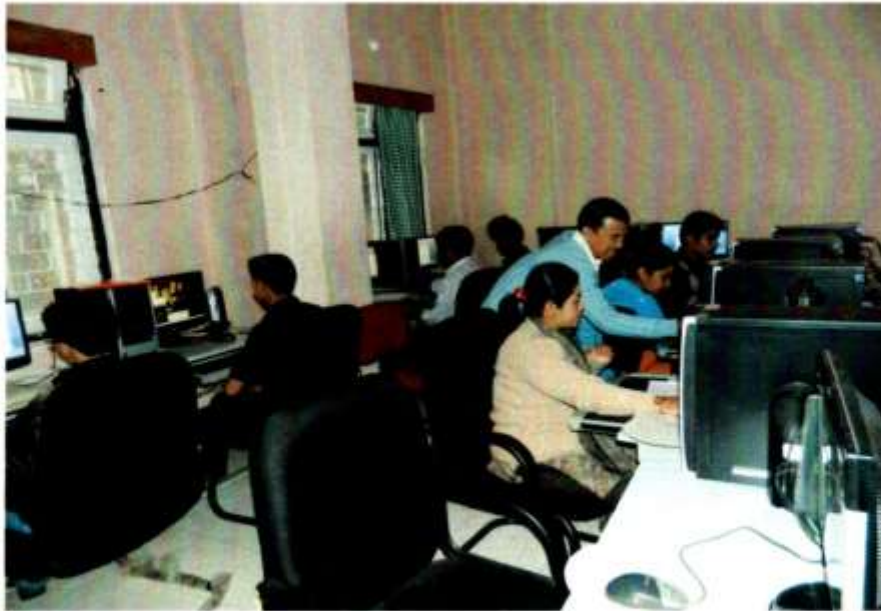
Computer students and Teacher

On 18 th -20 th April 2013- The final examination of the second batch of computer training.