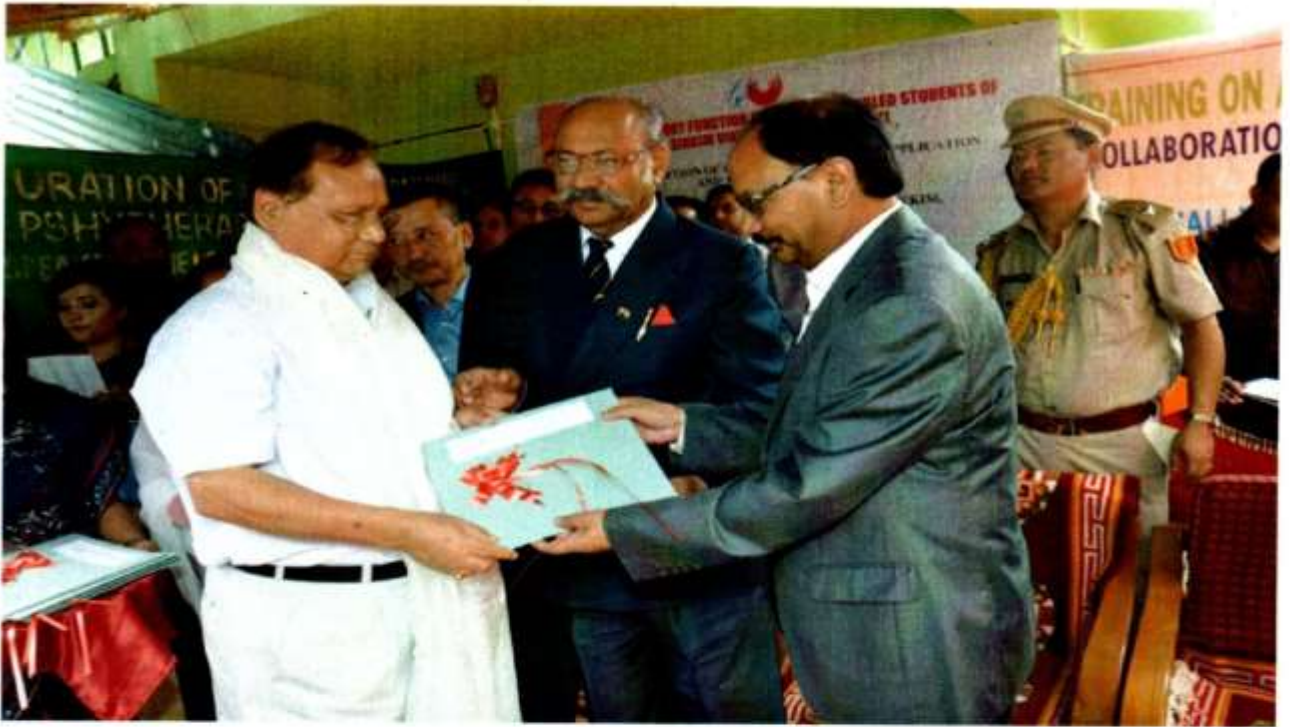
SVSS felicitated the Five Ways by Hon'ble HRDD Minister Shri N.K.Pradhan .