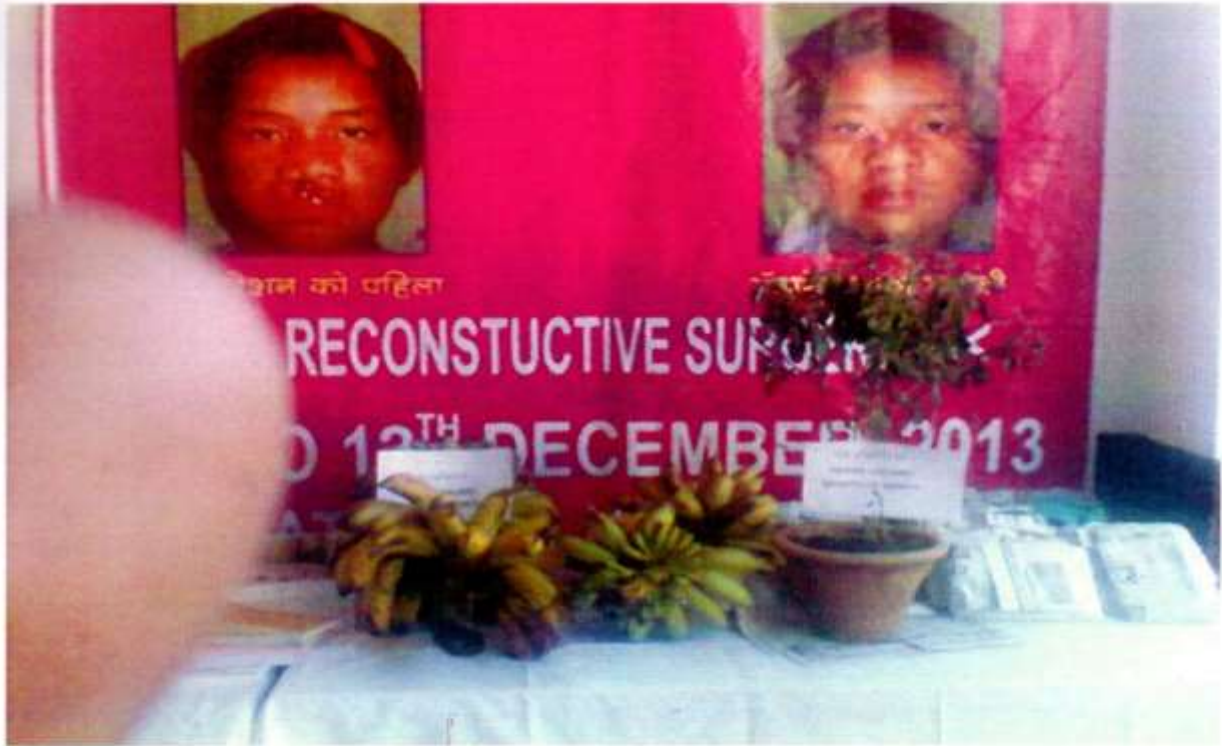
Display the products of Tulsi & Bannana from Reshap Tokel Berimok , South Sikkim, SVSS.