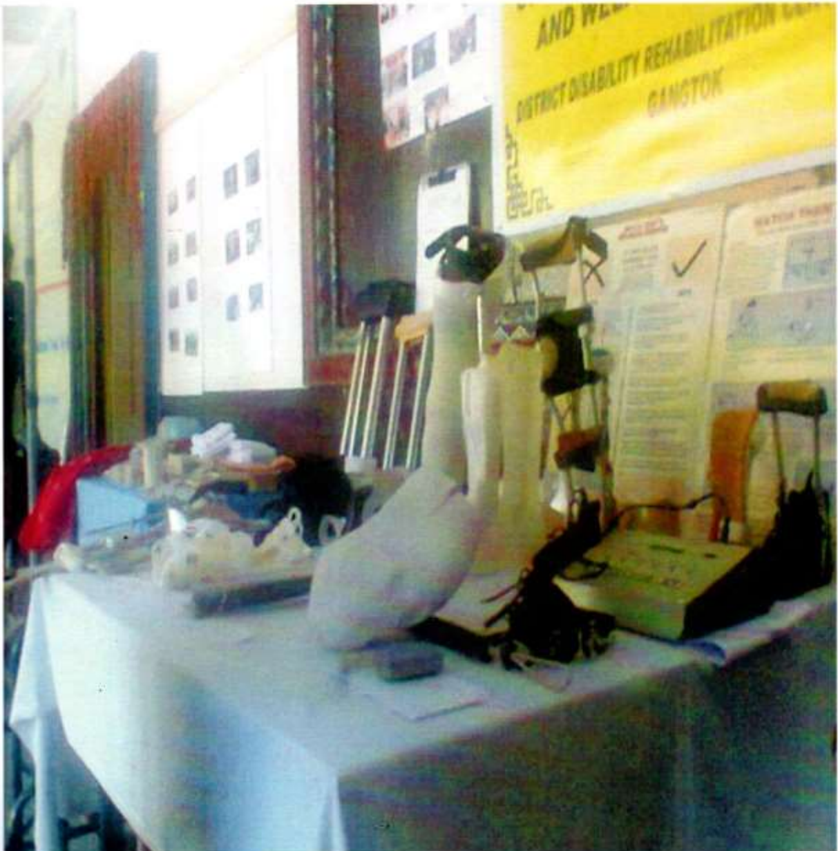
Workshop & Physiotherapy items

On 2 rd Dec 2013:- World Disability Day was jointly celebrated by three NGOs of Sikkim at T.N.A.School, organize by Social Justice Empowerment and Welfare Department of Government Sikkim, where Chief Guest was Hon'ble Chief Minister , Shri Pawan Chamling.