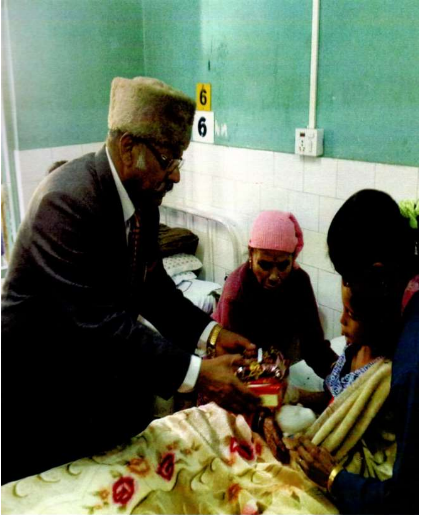
Hon'ble Governor Shri Shrinivas Patil provided a gift as a token of love to a girl patient.