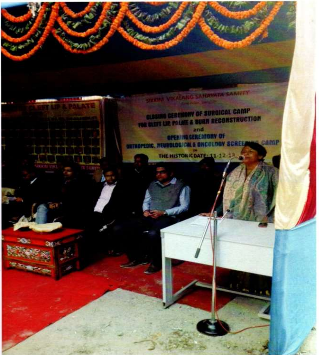
The speech of the President of SVSS at the time of closing ceremony.