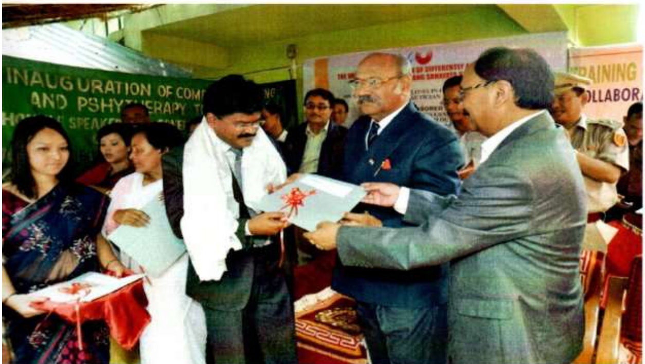
SVSS felicitated the HRDD Department by Hon'ble Governor of Sikkim Shri Shrinivas Patil.